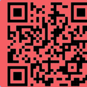
Application QR Code